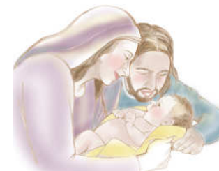
The Miracle of Christmas